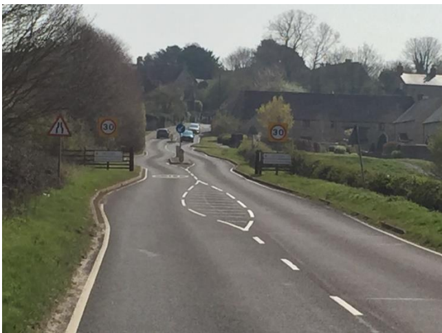
Ghost Island provision requiring minimal verge-take.