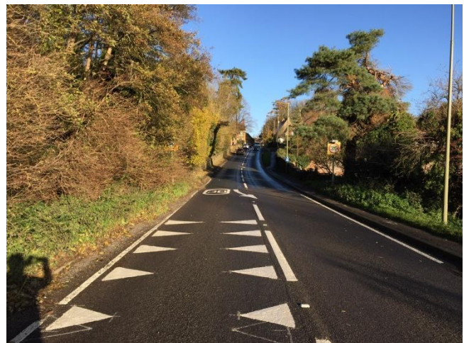
N/B from Duchess Bridge