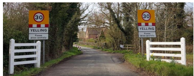
Painted Gates & Signs, Angled on Narrow Verge