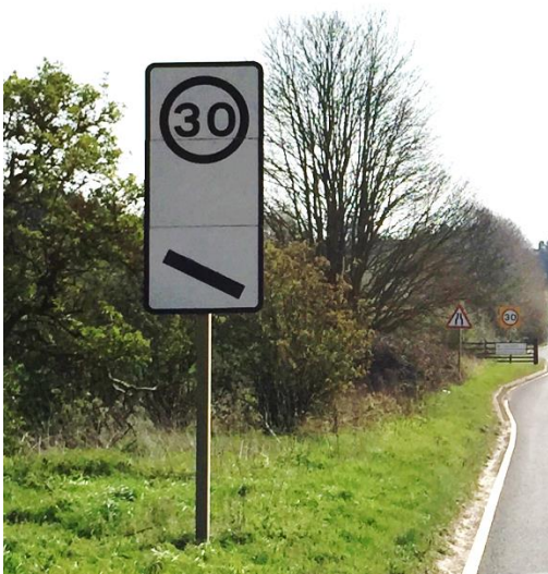
Count Down Marker