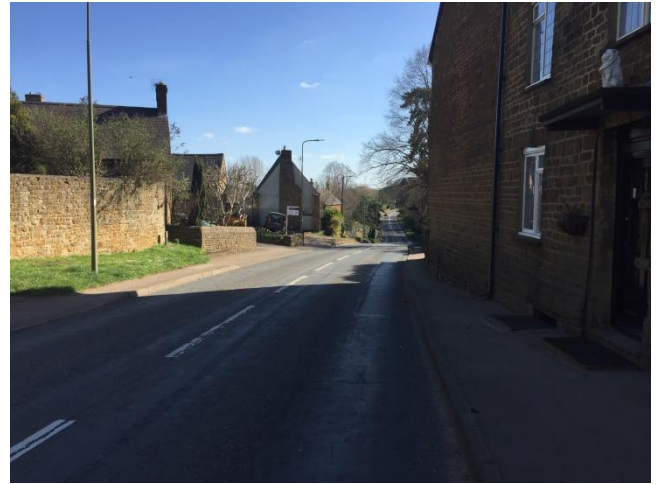
S/B West Adderbury Sign & Verge by Institute Wall