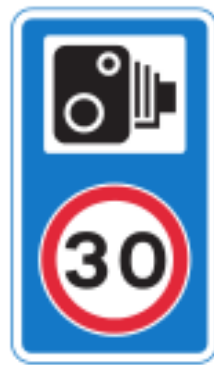
Diagram 880 Speed Repeater Signs and Roundels