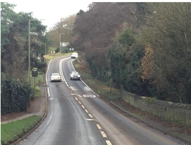
S/B Towards Duchess Bridge